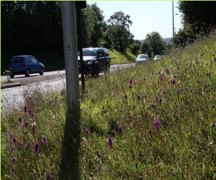
Loads of Pyramidal Orchids