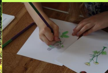
Fun in the garden