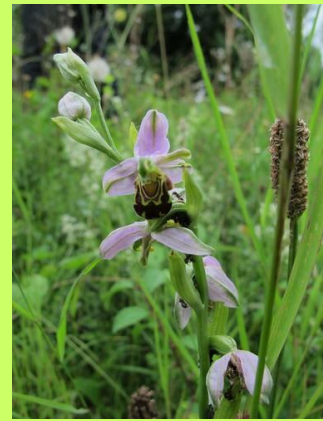
and a few Bee Orchids